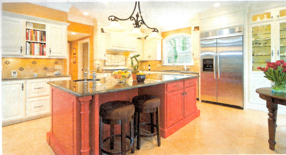
Acheron Construction produced dramatic results with the redesign of this Dallas area kitchen. The new space includes a large custom island, Acheron Private Label cabinets, a baking center, granite countertops, and a brick laid limestone backsplash accented by a decorative harlequin pattern above the gas range.