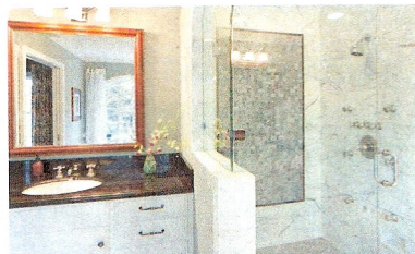
Doubled in size, the remodeled bath also attaches to a new walk-in closet created from attic space. Accenting the double shower is a striking basket weave pattern created with several shades of gray tile